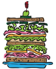
Lunch With the Pastor