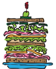
Lunch With the Pastor