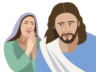
The Faith of a Canaanite Woman