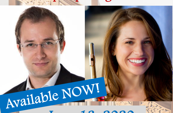
June 13, 2020

Go to vpcnaples.org and look in the SERMON LIBRARY or check it out on Facebook.